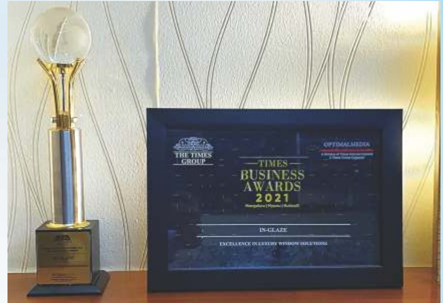
Times Business award for 'Excellence in Luxury Window Solutions', March 2021